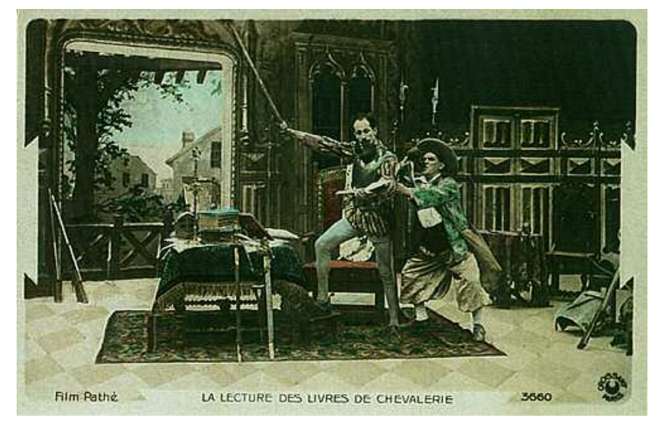
"Les Aventures de Don Quichotte de la Manche," Lucien Nonguet and Ferdinand Zecca in 1903