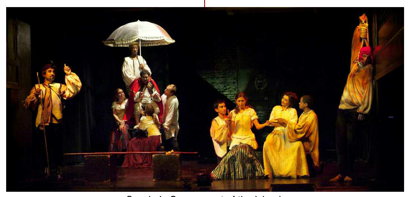
Sancho's Government of the Island.

The Princess and her accompanying players give Don Quixote to the Curate and the Barber, who will cage him in order to take him back to La Mancha. On the road, they meet with a procession that carries a statue of Our Lady of Sorrows. Don Quixote sees a real woman instead of the statue, decides to save her, and then he is confronted by one of the penitents. This is the last episode in which Don Quixote will see reality in a different way. Don Quixote has indeed failed in his adventures, but continues to face life with optimism and idealism, main elements of the Renaissance. After being hit on the shoulder by the penitent, Don Quixote decides that it is better to sit in the cage and be protected from other injuries. He is approached by some of the women in the procession and he believes that they mourn his life. At the end, they proceed on their way to La Mancha, not surrendering to pessimism, but hoping for a better life.