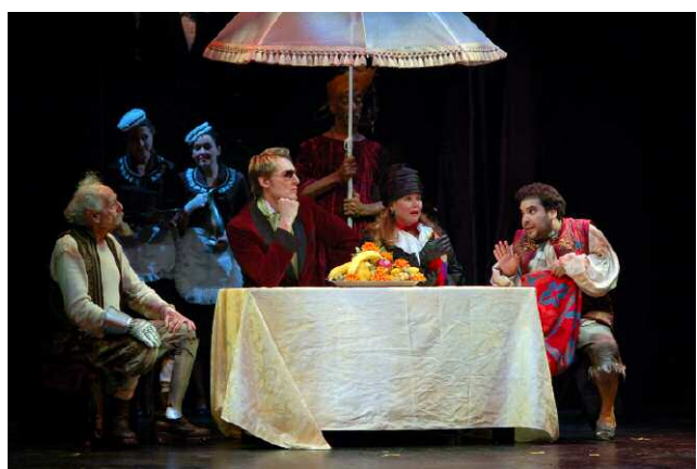
Don Quixote & Sancho with the Duke & Duchess.

literature and characters that have come to life. At this moment, the text subtly makes reference to the religious climate of the time in Spain, during major efforts by the Catholic Church to establish its power and presence in the country and its frequent interaction with different religions. The characters are then confronted by a cleric that warns the duke and duchess of Don Quixote's insanity. In a turn of events, the duke begins to take part in Don Quixote's world and grants Sancho the power to govern an isle of his own.