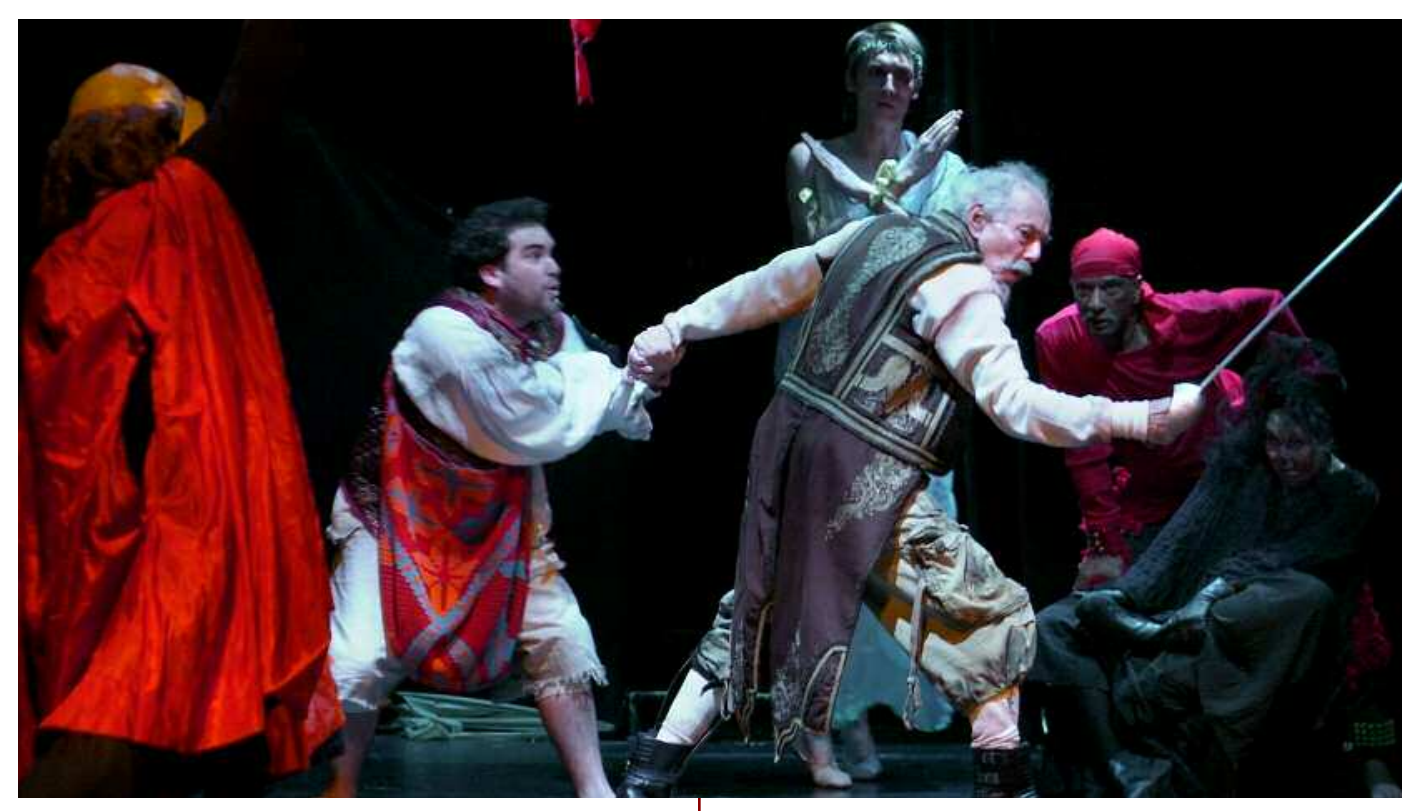
Don Quixote fighting against the "demons".