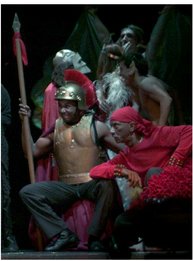
Cervantes is credited for managing multiple characters with a variety of perspectives.

for Spain, Fuchs discusses the interactions between Christianity and Islam in order to present that the Cervantes's Spain was not homogenous in any political, social or religious terms. In terms of religion, the people of Spain had different systems of beliefs such as Catholicism, Judaism and Islamism. The country was in constant negotiations of these religions and Don Quixote clearly shows some of the debate on religion. Consider, for example, how Cervantes introduces the character of Cide Hamete Benengeli, a Moor writer, as the actual writer of the text. Therefore, Don Quixote is a text that deals with part of the historical complexity of its time.